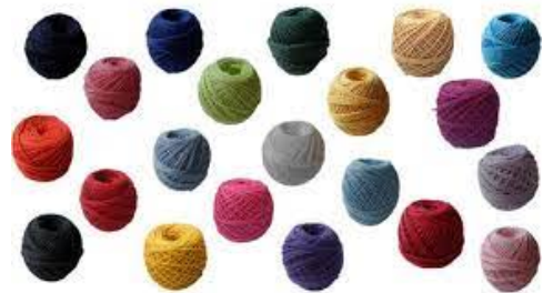
LANA DE COLORES